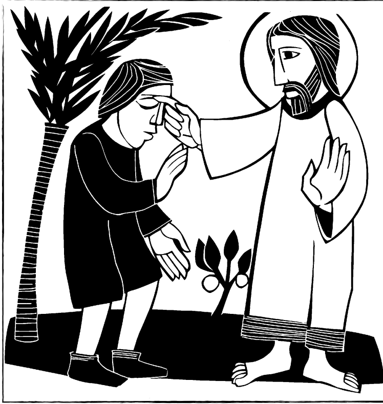
Jesus and the man born blind