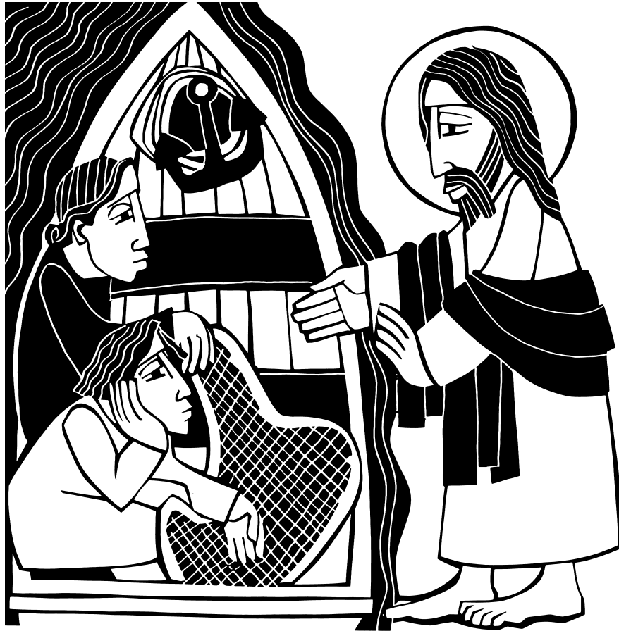
Jesus calls Simon and Andrew.